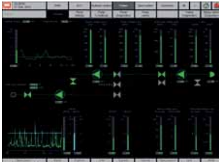
Example of SCADA presentation

Owners of density measurements become users of radioactive materials and they are therefore required by law to apply for a national licence for the application, possession, transport or handling of radioactive materials according to the standards of the IAEA (International Atomic Energy Association) in Vienna.