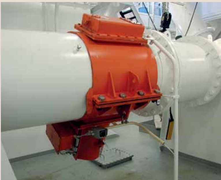
Clamp-on type density transmitter

with adapted flanges that can be installed in the dredger’s discharge pipeline. Finally, the integrated version is mounted on an electromagnetic mixture velocity transmitter, combining all the measurements needed for production calculation and providing the benefit of short building length. Of course, all the versions comply with mechanical standards and safety rules, hardening them for the rough dredging environment. ISO-9001-supported production ensures quality.