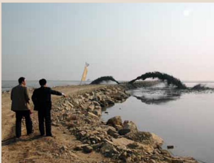
Production efficiency is vital in dredging jobs