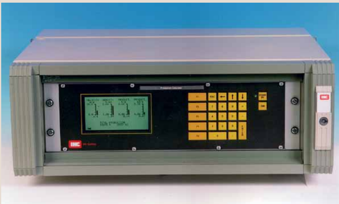
IHC Systems Production calculator PRC

SCADA screens or, for example, on the IBIS system used on IHC Beaver® dredgers.