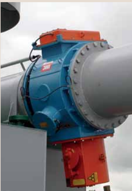
Integrated density and velocity transmitters

can be of the fixed or the onboard replaceable type. For the latter type, optional mounting dismounting tools are available.