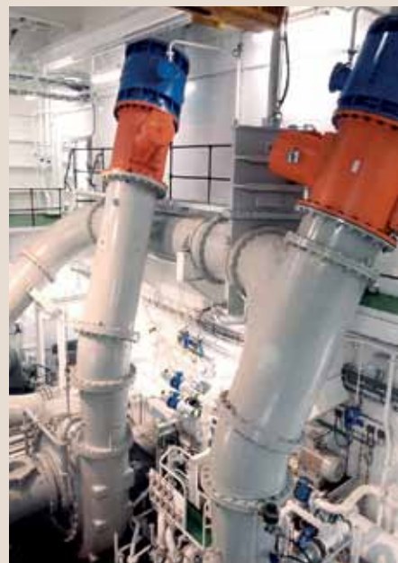
Separate density and velocity transmitters