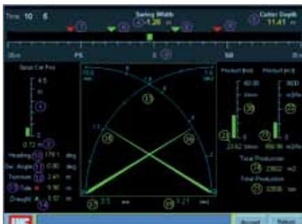
IBIS production presentation