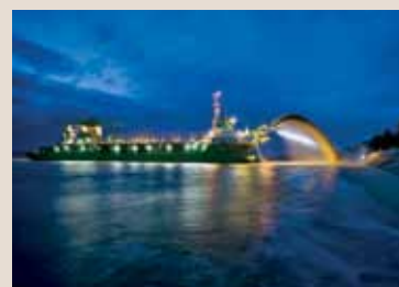
... both on TSHDs ...