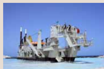
... and on CSDs